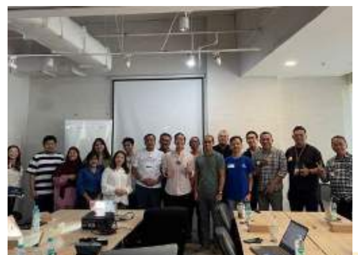
Montoring Class #6: Fundraising