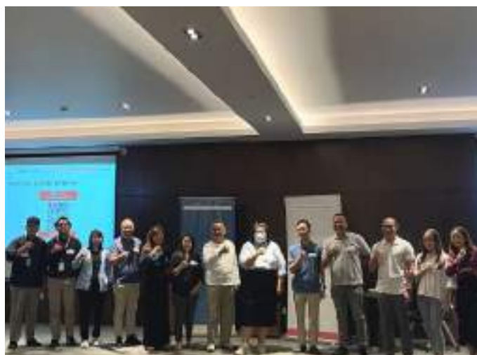
Montoring Class #2: Founder's Lab