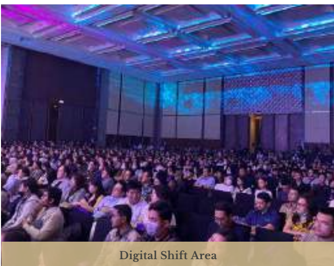
Digital Shift Area