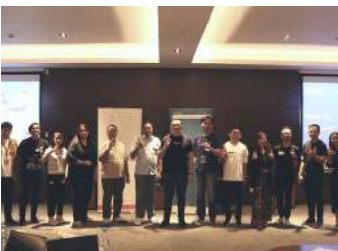
Montoring Class #4: Value Creation & Revenue