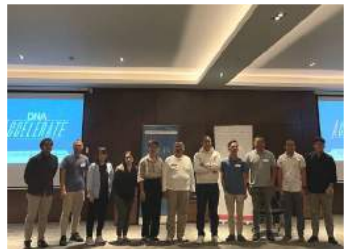
Montoring Class #3: People & Culture