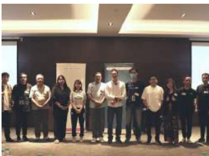
Montoring Class #5: Financial & Decision Making