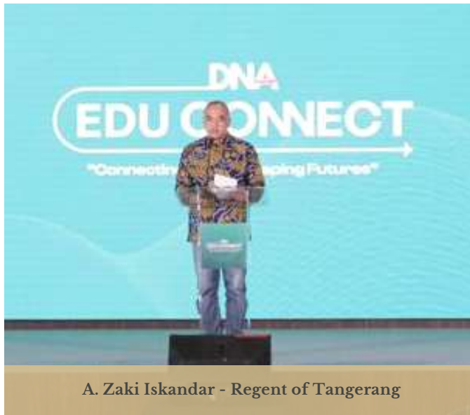
A. Zaki Iskandar - Regent of Tangerang

The Digital Hub in BSD City, with its comprehensive educational facilities, played a crucial role in driving urban activity. The presence of formal and informal educational institutions, offering both national and international vocational education standards,