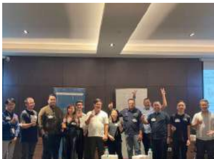
Montoring Class #1: Product & Market