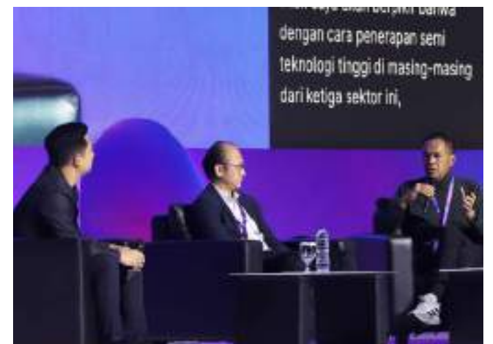
Gita Wirjawan (Educator, Entrepreneur, and Host Endgame Podcast) Session