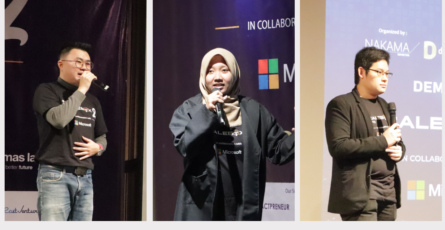
Sinar Mas Land's ends Scalebox cycle 2 Program with Demoday