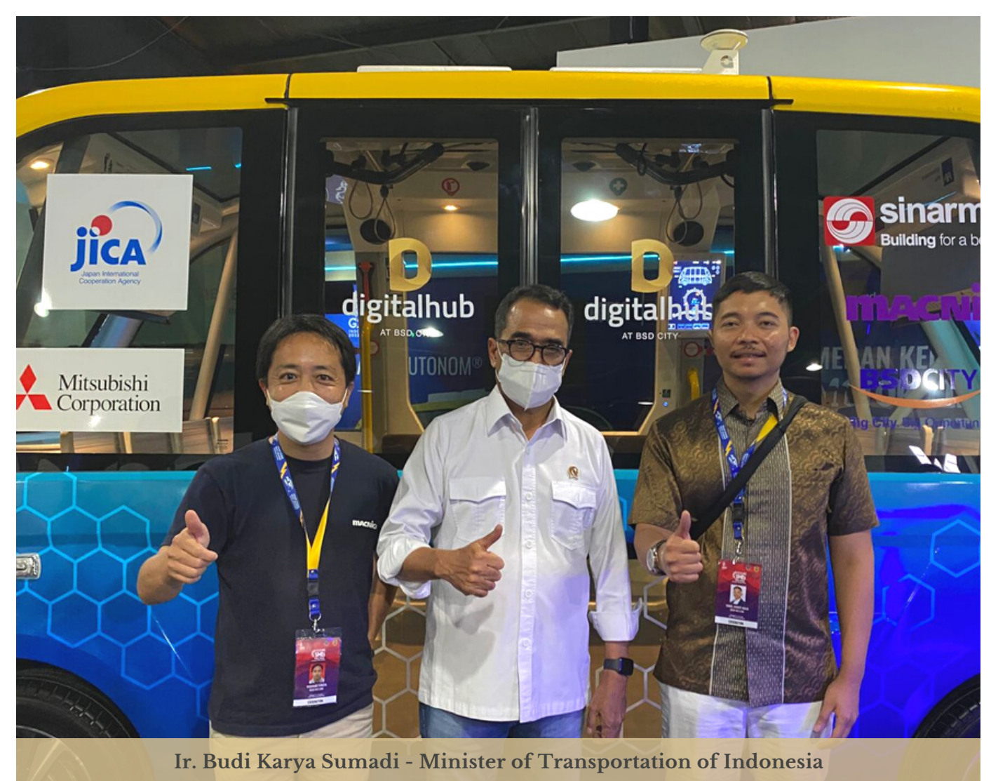
The G20 held a side event that showed various modes of transportation with the green mobility concept that already exist in Indonesia, where Sinar Mas Land showcased its Autonomous Vehicle trial in BSD City

The AV trials at BSD City have been conducted in two locations; at Q-Big and BSD Green Office Park (GOP). The first of the locations is a shopping and lifestyle center built with an environmentally friendly concept, complete with eco-friendly materials and energy-efficient building features. Meanwhile, as the name suggests, the second is Indonesia's first green office in a district encompassing a total area of approximately 25 hectares.