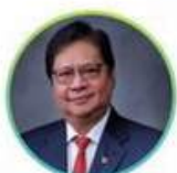
Airlangga Hartarto Coordinating Minister for Economic Affairs