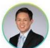
Chan Chun Sing Singapore Minister for Trade and Industry